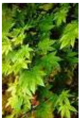
Vine maple Acer circinatum

These principles include landscape design strategies to integrate rain water detention and distribution with green roofs, rain gardens, pedestrian and cyclist pathways called "Green Streets", and ponds within park spaces. Landscape strategies also call for maximum retention of existing trees, the use of native