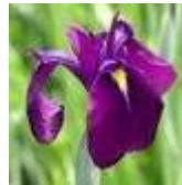
Water Iris Iris ensata 'Variegata'