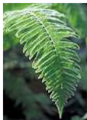
Western Sword Fern Polystichum munitum