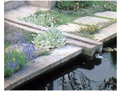
Rain channels run along side the patios

forest", as well as its sustainability strategies, in several ways.