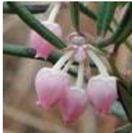
Bog Rosemary Andromeda polifolia 'Blue Ice'

fern, vine maples, and flowering dogwoods to enhance the wild-life habitat. Bog rosemary and iris that like wet conditions, but are tolerant of drier summer periods, have been selected for the rain gardens. Other ornamental plants, like grasses and perennial flowers, will add color and have been selected for their ability to tolerate the wet and dry conditions in the green roof and rain garden zones.