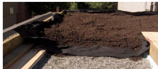
Filter Fabric and Soil