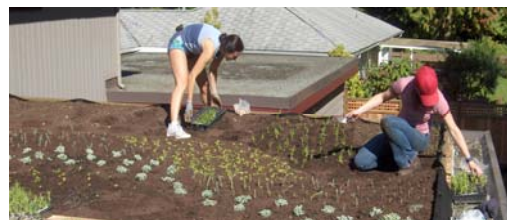
Planting the Roof