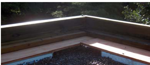
Drainage and Framing Details