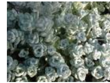
Sedum 'Capa Blanca'

Carpet', Sedum 'Capa Blanca', Delosperma 'Gold Nugget', and selected dwarf conifers, miniature daffodils and irises.