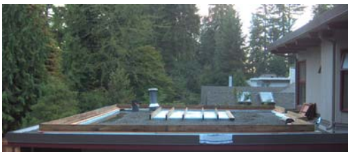
Framing and Deck Base